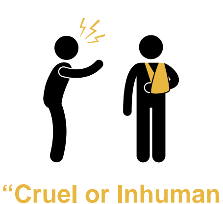
Treatment" such as bodily harm, false accusation of adultery or homosexuality, or mental/ physical abuse from one spouse to the other