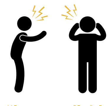
"Irreconcilable Differences" between parties